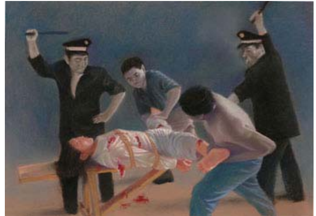
A painting depicts guards torturing a practitioner while inmates assist them.

None of us in Free Countries around the world understand what it takes for China's oppressed to stand up and demand their most basic human rights under the totalitarian regime of the Chinese Communist Party (CCP). While we have the rule of law, they face the ruling CCP sitting on their backs telling them what to do, what to say, and what to believe. While we can criticize our governments in a free press protected by a Constitution, under the CCP the Party is the boss responsible for what they should know, the policeman who arrests them without cause, the judiciary that finds them guilty of violating arbitrary laws, without evidence or due process, and the prison guard who tortures them for having just one independent thought.