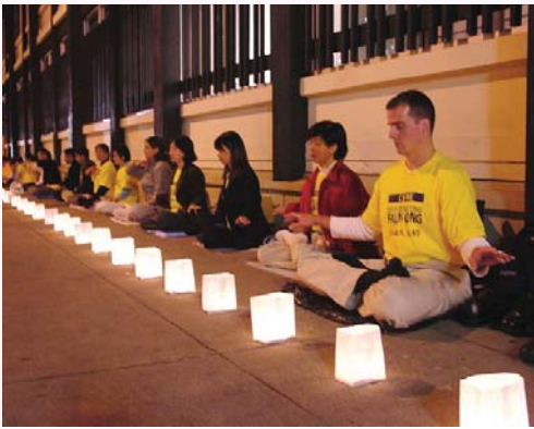
Candlelight Vigil outside of the Chinese Consulate in San Francisco

In California alone, the two Chinese Consulates had sent