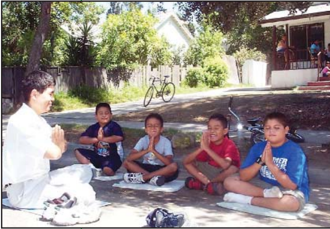
Kids is learning mediation in the health fair

On September 7, 2002, Pasadena Falun Gong practitioners participated in a Health Fair organized by the city council member Mr. Victor Gordo. The peaceful and beautiful exercise demonstration attracted many local residents. The local TV station interviewed practitioners. Many residents asked for flyers about practice sites and workshops. A small group of Mexican children learned the exercises at the site.