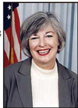
Rep. Lynn Woolsey

On June 11, Congresswoman Lynn Woolsey (D-CA 6) chaired a Congressional Briefing focusing on the harassment of U.S. officials and Falun Gong practitioners by the P.R.C.'s foreign entities, such as the Chinese Consulates in San Francisco and Los Angeles.